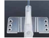
WINGS- SUTURE HOLES